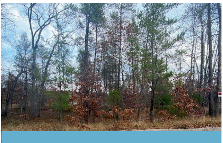
Will Drive - Indian River

We have broken ground on our next home rehab project! We are moving the large garage to the neighboring vacant lot and rehabbing this garage into a 2 bedroom home! By making good use of the large 2 lots we have purchased, we are able to serve 2 families making these projects even more affordable.